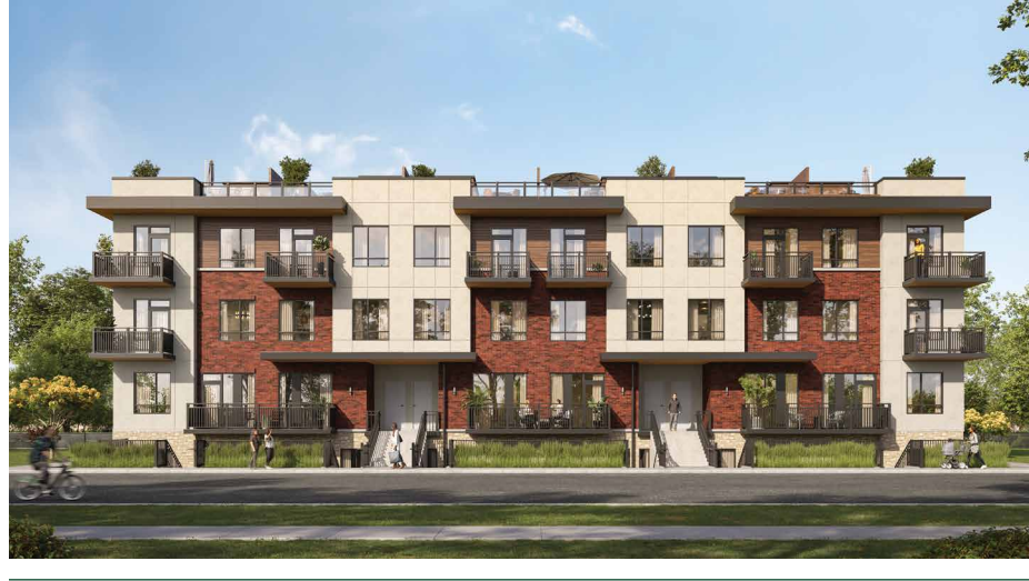
Elevation C Block 14

1 Bedroom 1 Bathroom Indoor: 515 sq.ft. Outdoor: 96 sq.ft. Total: 611 sq.ft.