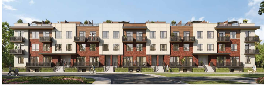
Elevation A Block 1

2 Bedrooms Indoor: Outdoor: Total: 2 Bathrooms 1,010 sq.ft. 79 sq.ft. 1,089 sq.ft.