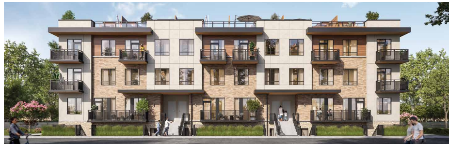
Elevation E Blocks 5, 10 & 11

All renderings and elevations are artist's concept only. Sizes, materials, and specifications subject to change without notice. E. & O.E.