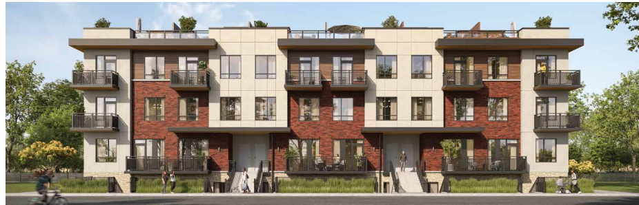
Elevation C Blocks 3, 7 & 14