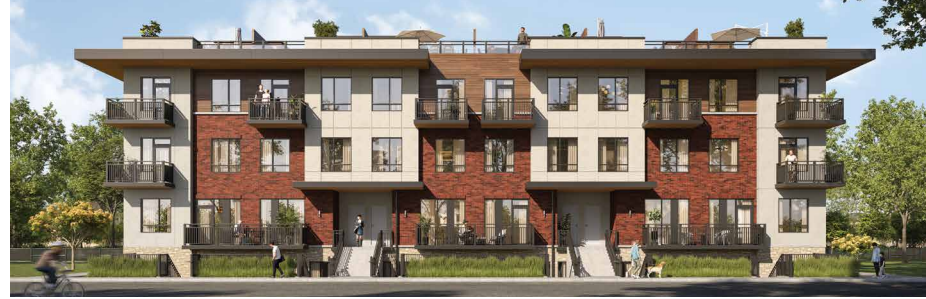
Elevation B Blocks 2, 6, 8, 9 & 12