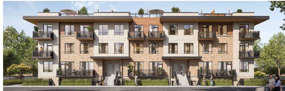
Elevation D Block 4