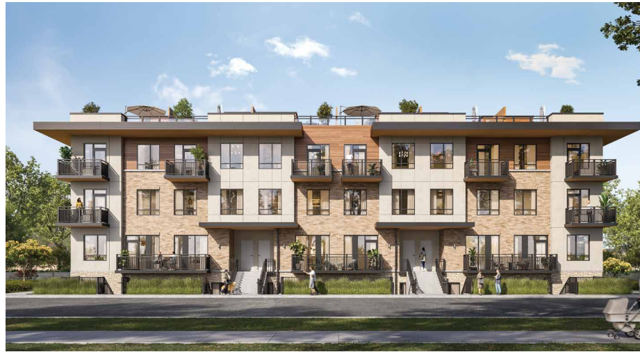
Elevation D Block 4