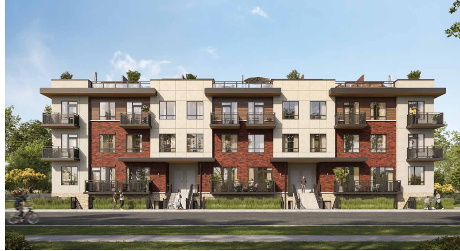
Elevation C Blocks 3 & 7