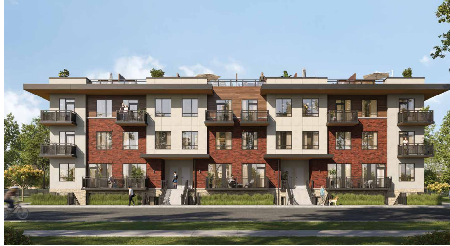
Elevation B Blocks 2, 6, & 12