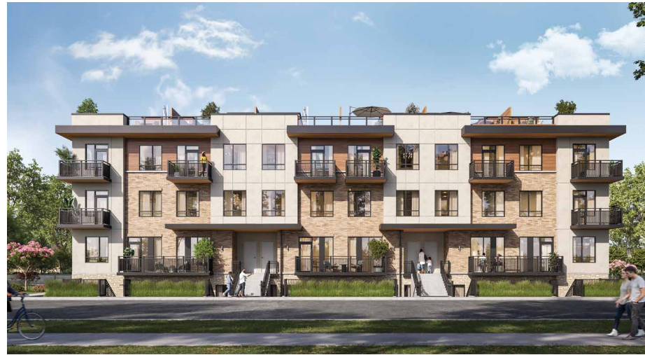
Elevation E Blocks 5, 10 & 11

3 Bedrooms 2.5 Bathrooms Indoor: 1,111 sq.ft. Outdoor: 239 sq.ft. Total: 1,350 sq.ft.